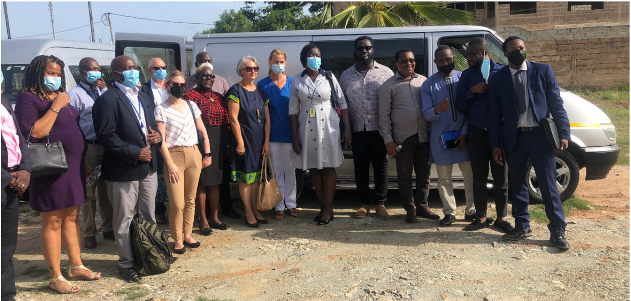
USAID, FHI-360 & WAAF team in front of the mobile clinic van

A 10-member team from PEPFAR - USAID consisting of students and staff from the USA and some African Countries paid a working visit to WAAF and IHCC to learn about the Meeting Targets and Maintaining Epidemic Control (EpiC) project. With support from FHI 360 Ghana EpiC team, the visitors received an introduction and overview of the project. The WAAF team gave a brief background of WAAF and IHCC, its past and current projects, activities, as well as progress and results achieved so far on the EpiC project.