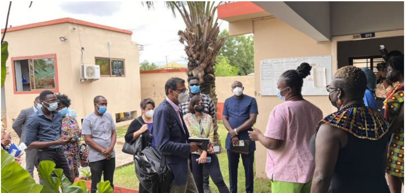
A nurse from the WAAF clinic leading the USAID team during a tour of the facility