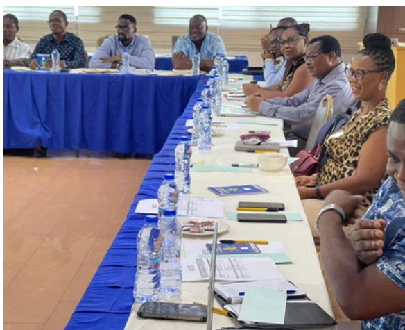
Participants seated in the STAR Ghana COP Meeting