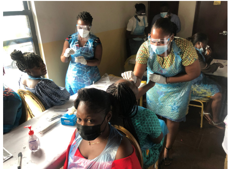
COVID-19 PCR Testing Training under IMPAACT4C19