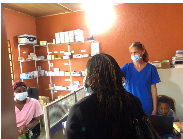
CQUIN representatives on a tour of IHCC