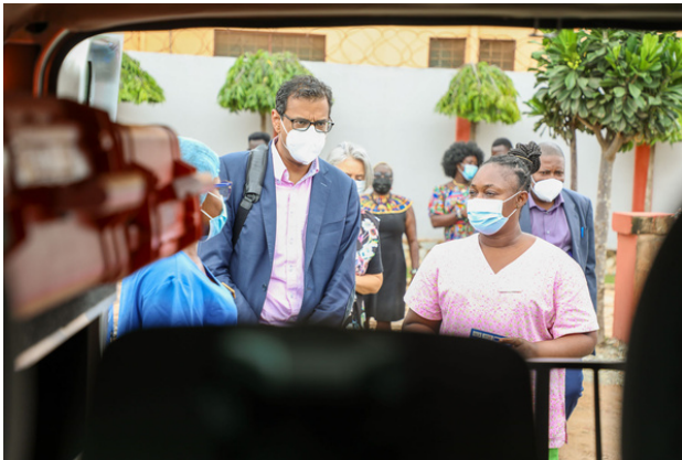
Inspection of the mobile clinic van