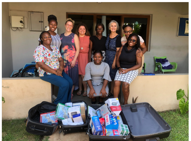
St. Catherine University donates clinical items to IHCC