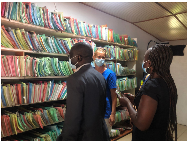
CQUINN reps reviewing how clinic data is stored