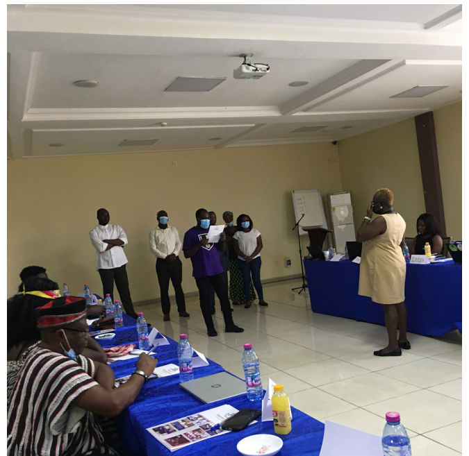
EpiC Refresher Training at Tomriek hotel